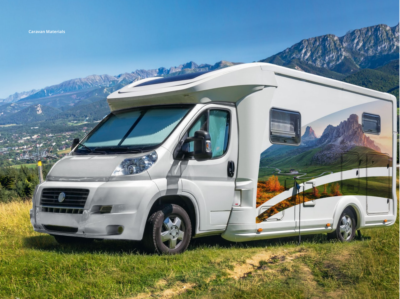
Example of ORAJET® 3106SG