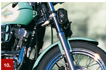
Example 10 ORACAL® 383

The RapidAir® -Technology of the ORALITE® 5650RA material enables easy and quick application reducing the incidence of bubbles and creases, especially of large-sized applications.