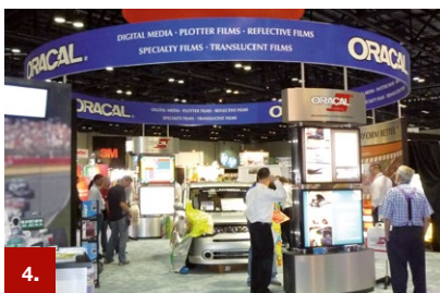
Example 4 ORACAL® 631

This plotter film is constructed specifically for use on banners, ribbons and other flexible surfaces. It adapts well to any surface, remains stable even under demanding conditions and may be easily removed without any trace. Possibilities are endless with a colour range of no less than 23 standard options.