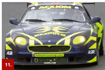
Example 11 ORACAL® 7510