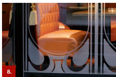
Example 8 ORACAL® 8810