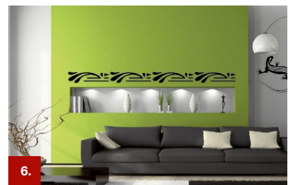
Example 6 ORACAL® 638