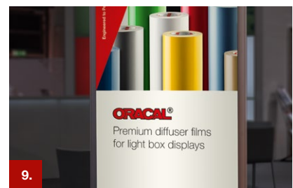
Example 9 ORACAL® 8830