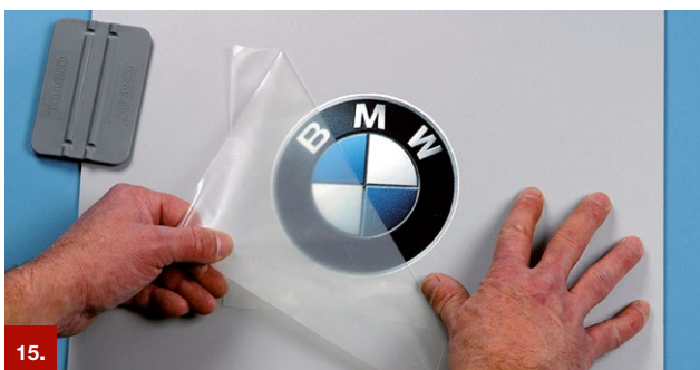
Example 15 ORATAPE® MT95

ORAFOL has developed application materials for a great variety of demands and uses.