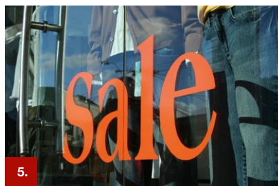
Example 5 ORACAL® 641