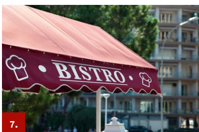
Example 7 ORACAL® 451

The typical use of the new diffuser films is application inside light box displays, where they will ensure evenly distribution of the light, as well as prevent unwanted external visibility of the internal light sources. They provide an easy means of getting a perfect finished look to any internally lit display, and are designed for use with both LED and general light sources. The materials come in two different light transmission grades.