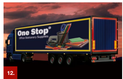
Example 12 ORALITE® 5600E