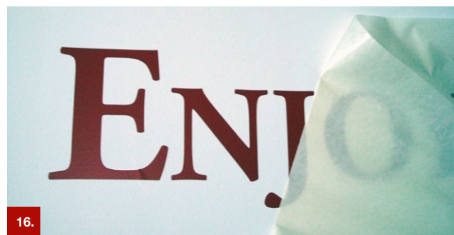
Example 16 ORATAPE® LT52